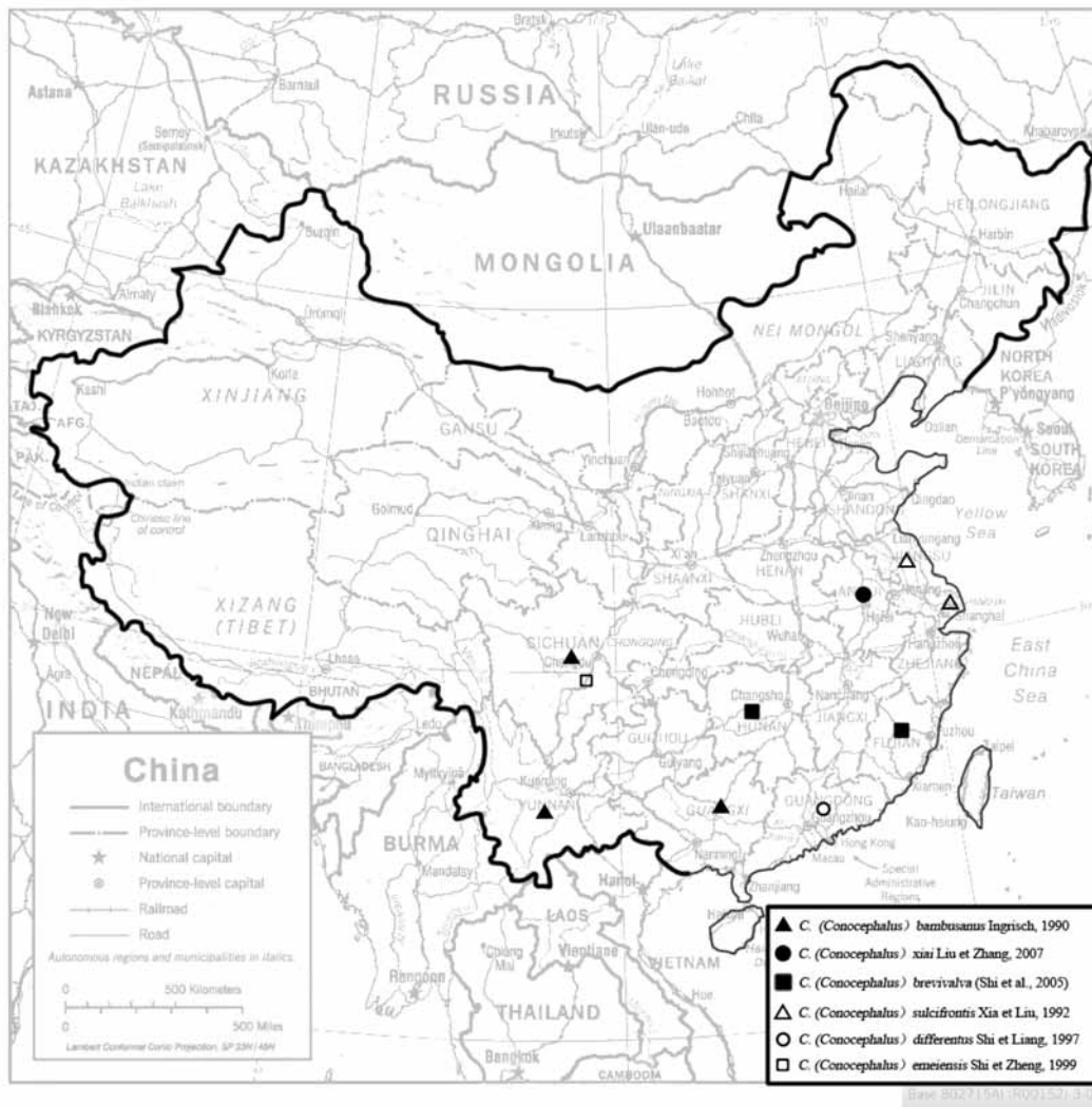
FIGURES G. Distribution map of subgenus Conocephalus in China.

Type species: Locusta fusca Fabricius, 1793