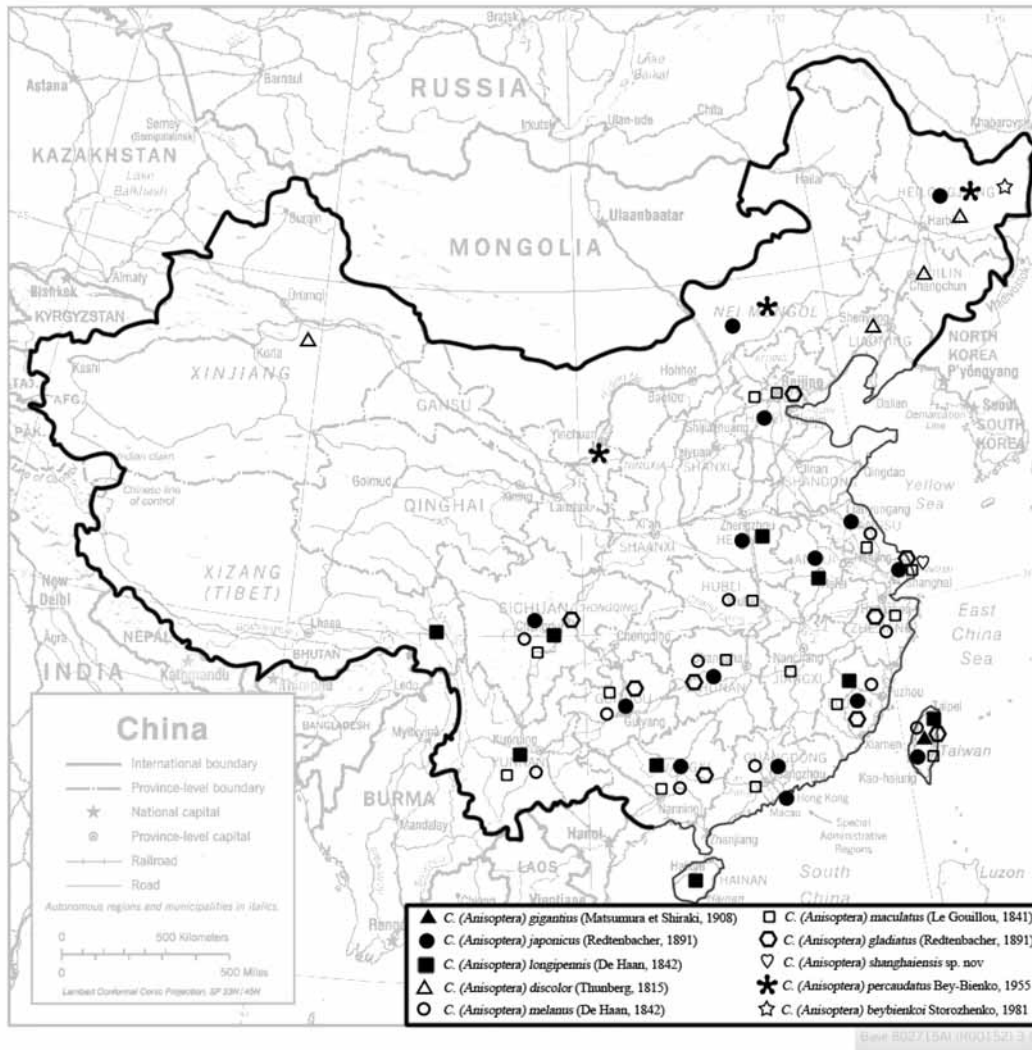
FIGURES I. Distribution map of the species of genus Anisoptera in China.