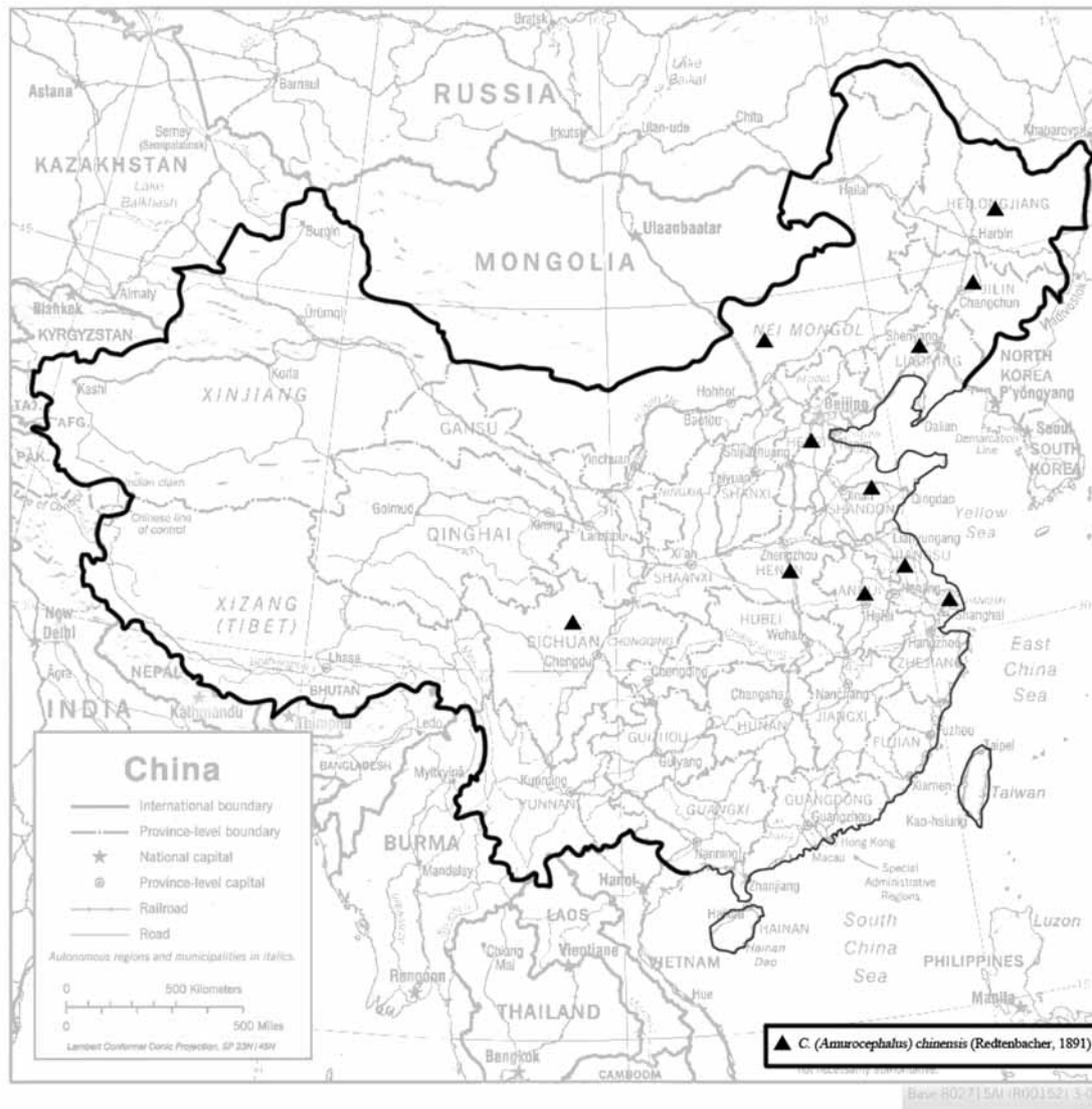
FIGURE F. Distribution map of subgenus Amurocephalus in China.